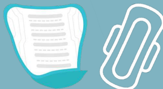
Contenance & sanitary products

If you are having incontinence issues contact the National Continence Helpline on 1800 33 00 66